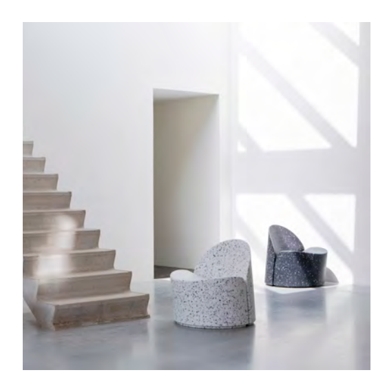
Available from stock in 3 colours recycled plastic