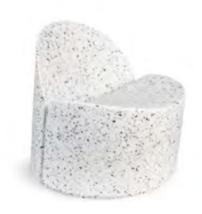
LOUNGE CHAIR BLOOM BA31001 WHITE-TERRAZZO