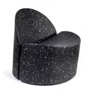
LOUNGE CHAIR BLOOM BA31002 BLACK-GALAXY