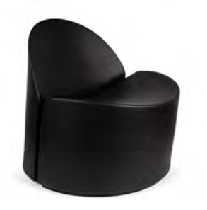
LOUNGE CHAIR BLOOM BA31000 BLACK-BLACK