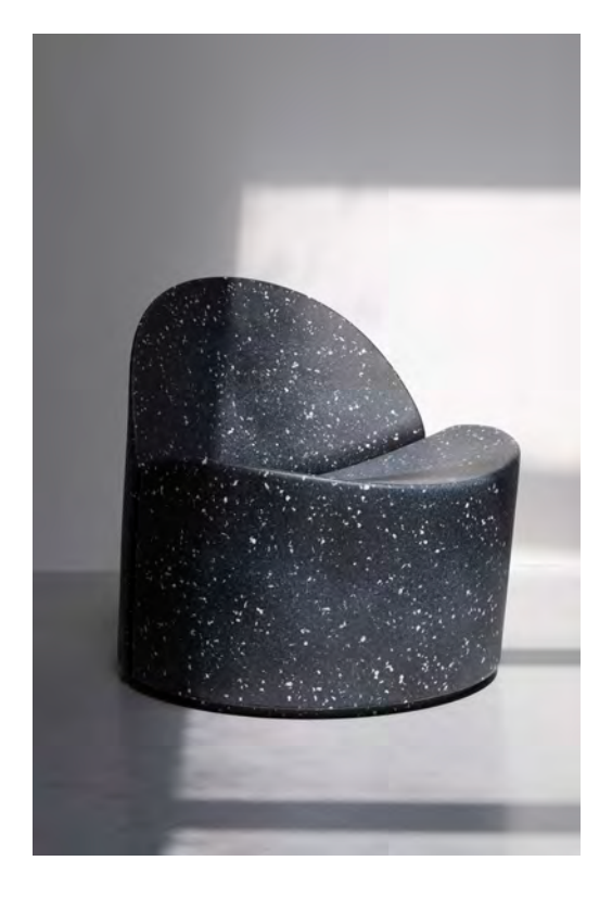
Do something about plastic waste: sit on it